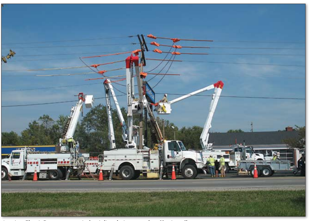
American Electric Power crews repair electric lines during outage from Hurricane Ike.

In the AEP case, decided at the end of 2008, the OCC asserted the utility's application lacked detail and should not be approved unless the utility could prove the expenses were lawful, reasonable and prudently incurred. The OCC also asserted that the method used to calculate interest on the deferrals should be altered to reduce the charges to consumers.