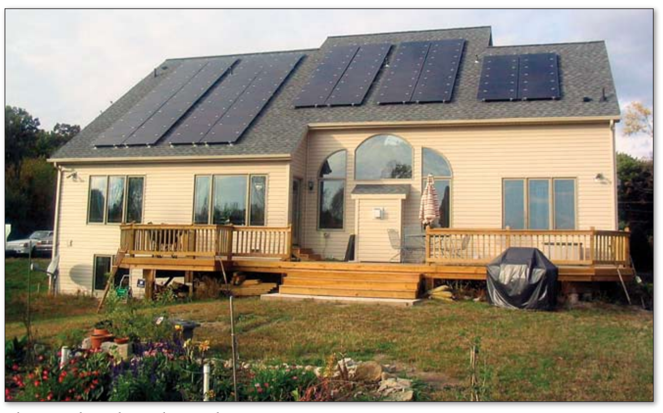
A house uses solar panels to supplement its electricity use.

Dayton Power and Light (DP&L) applied for, but did not win, a smart grid grant from the federal government. By the end of 2009, DP&L was still trying to build its business case for implementing smart grid technology in its service territory.