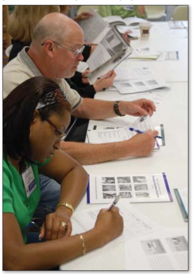
Members of the OCC's Southwest Community Advisory Panel review materials.

CAP members represent community action agencies, jobs and family services departments, local governments, area agencies on aging, social service