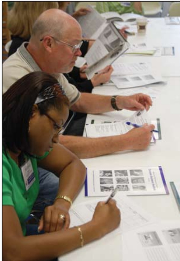
Members of the OCC's Southwest Community Advisory Panel review materials.

CAP members represent community action agencies, jobs and family services departments, local governments, area agencies on aging, social service