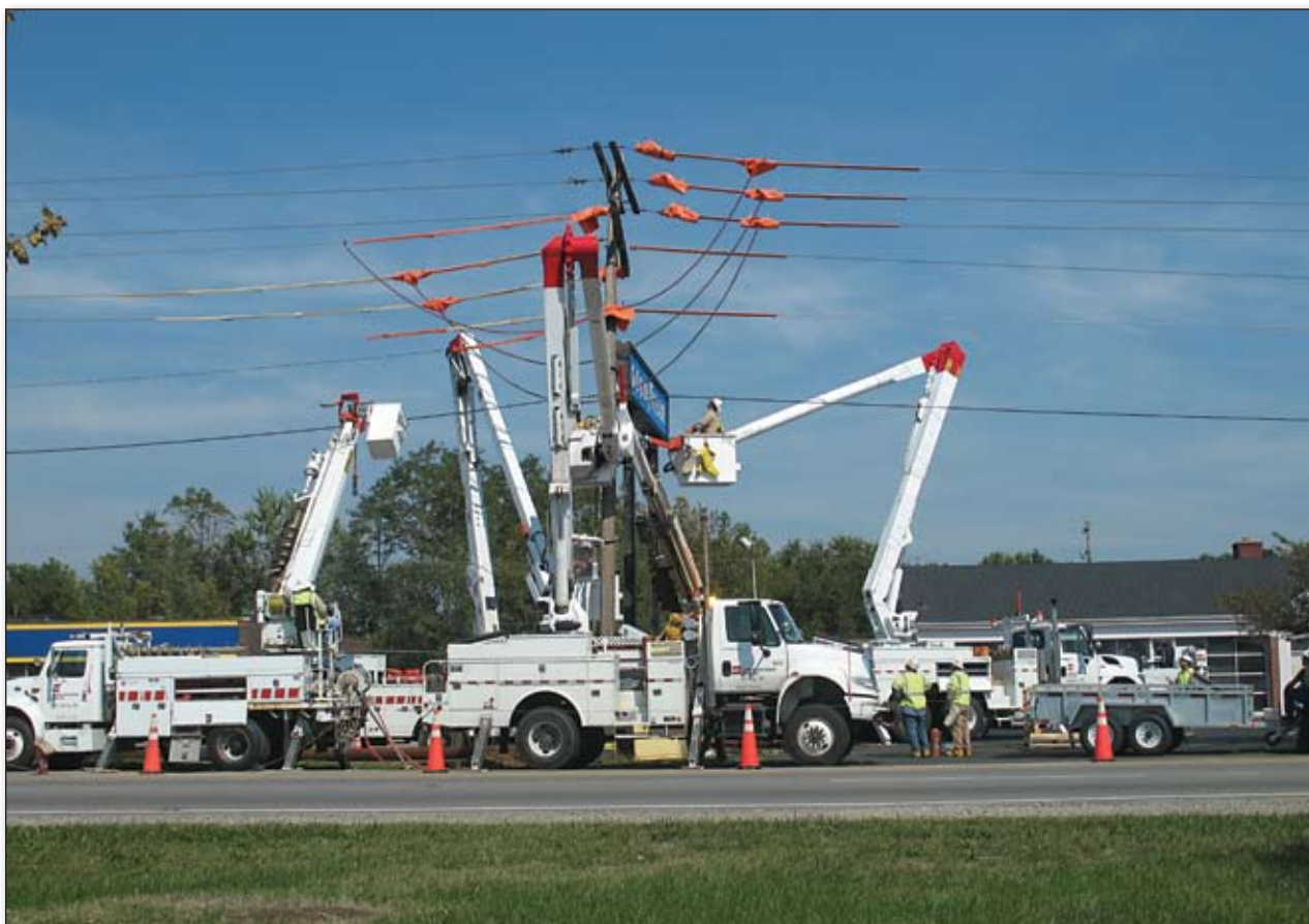
American Electric Power crews repair electric lines during outage from Hurricane Ike.

In the AEP case, decided at the end of 2008, the OCC asserted the utility's application lacked detail and should not be approved unless the utility could prove the expenses were lawful, reasonable and prudently incurred. The OCC also asserted that the method used to calculate interest on the deferrals should be altered to reduce the charges to consumers.