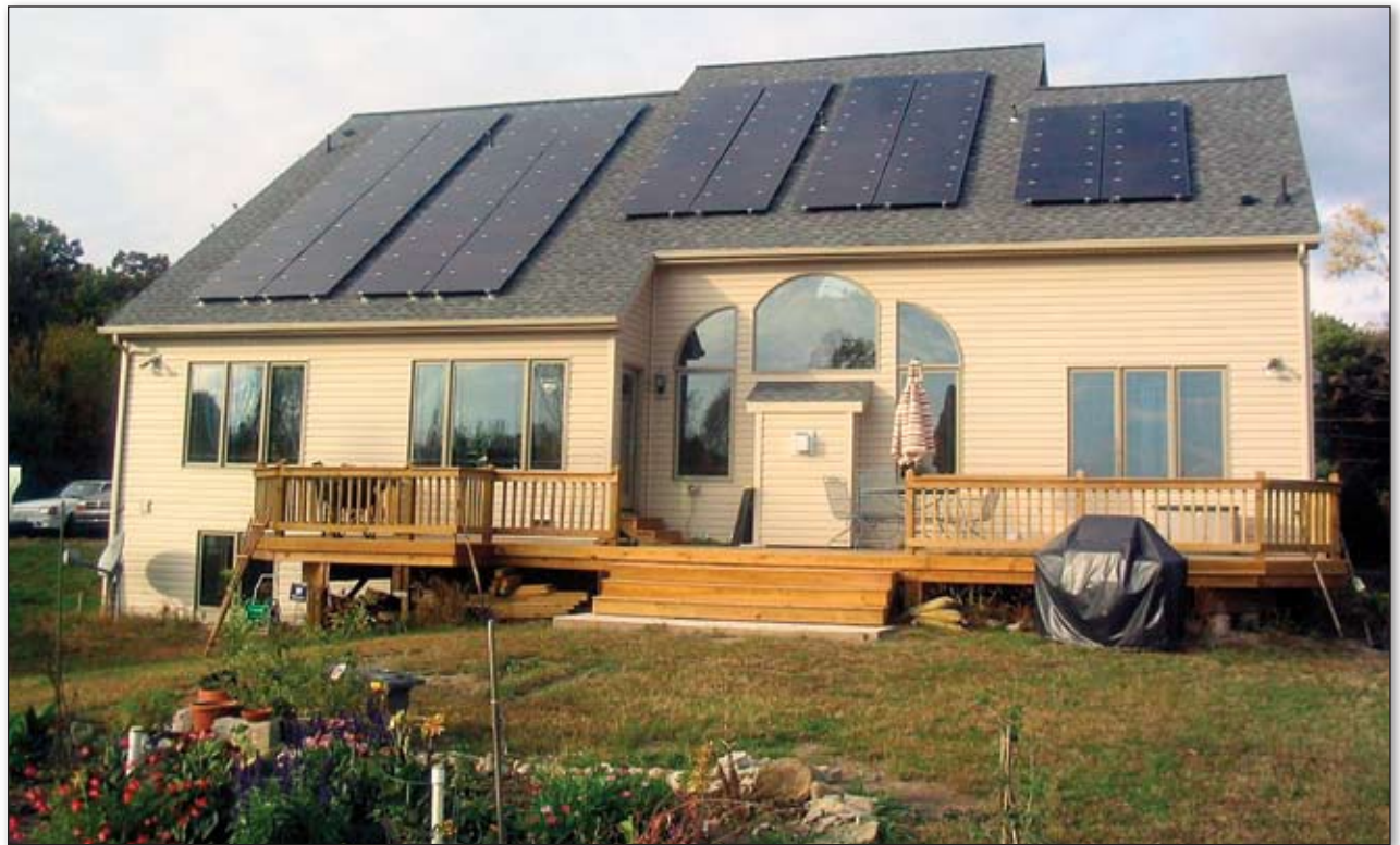
A house uses solar panels to supplement its electricity use.

Dayton Power and Light (DP&L) applied for, but did not win, a smart grid grant from the federal government. By the end of 2009, DP&L was still trying to build its business case for implementing smart grid technology in its service territory.